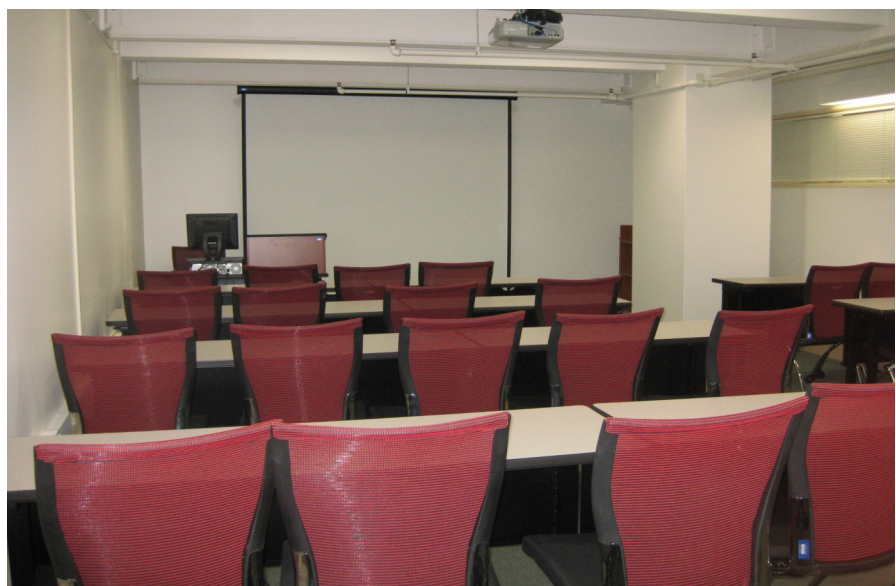
Conference Room #8