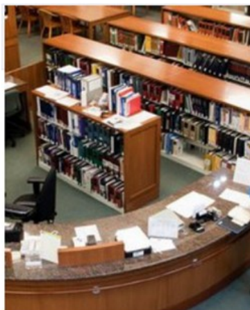
Screen Shot: Alameda County Law Library on Facebook