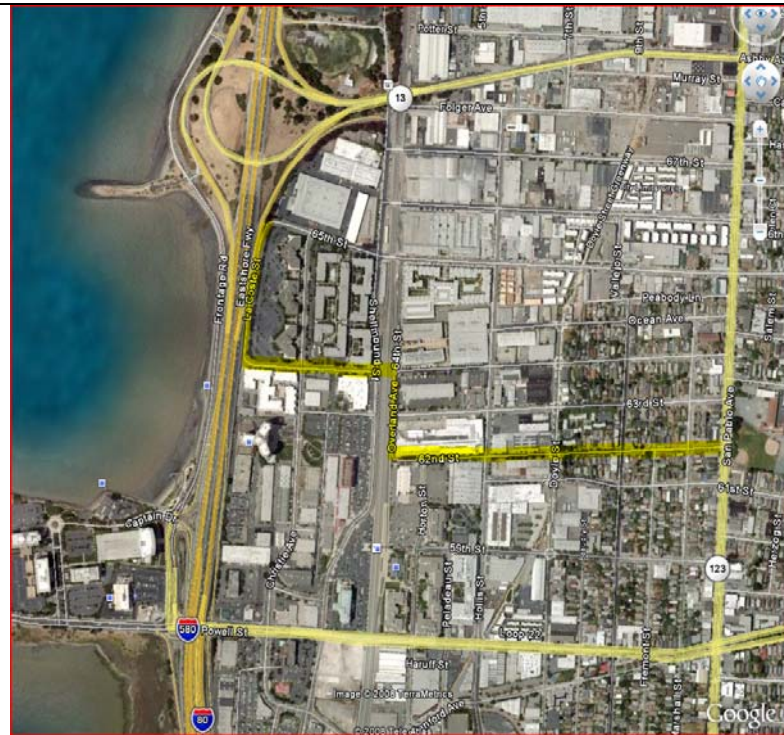
Michael Brantman Associates 25580003 • 10/2008 | 1_regional.mxd Regional Location Map COUNTY OF ALAMEDA PUBLIC WORKS AGENCY - BYPASS CONSTRUCTION OF ZONE 12 LINE 5, EMERYVILLE DRAFT CULTURAL RESOURCES ASSESSMENT

The Negative Declaration (ND) and the initial study upon which it is based are available for review at the Alameda County Public Works Agency offices 399 Elmhurst Street Hayward, CA 94544 and at the PWA Website: http://www.acpwa.gov/pwa . Copies of the Initial Study are also available at the Berkeley Public Library, Claremont Branch, 2940 Benvenue Avenue, Berkeley, CA and at the Oakland Main Library, 125 14 th Street, Oakland, CA. The document concluded that the project would not result in any significant adverse impacts. If you disagree, please include your reasons with your written comments. The Alameda County Board of Supervisors will consider the ND and all comments received prior to its adoption or approval of the project. Written comments will be accepted during the public review period from December 30, 2008 to January 30, 2009. Comments should be addressed to the address below: